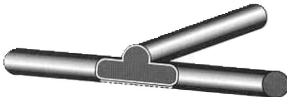
FIG. 1 Cutaway Section of Weld

The welding is accomplished by an electronically controlled electrical process employing the principle of fusion combined with pressure, which actually fuses the intersecting wires into a homogeneous section without loss of strength.